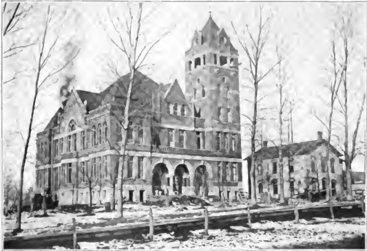
COURTHOUSES, OLD AND NEW, FOREST CITY, 1896